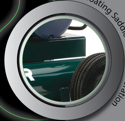
Floating Saddle Reduces Vibration