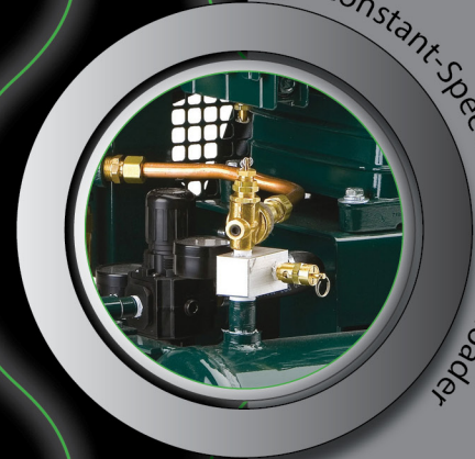
Constant-Speed w/ Pilot Unloader