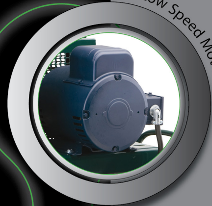
Low Speed Motor w/ Reset