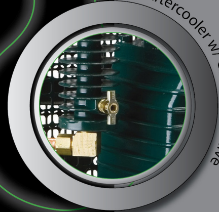
Aftercooler w/ Cold Start Valve